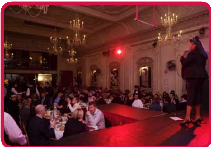
Main Hall - Stage View