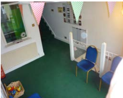
Small Room 4 x 1.8 M