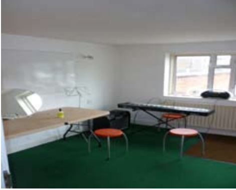
Medium Room 4 x 3.4 M