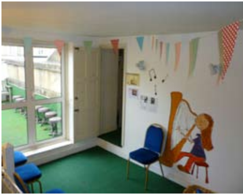
Waiting Area 3.9 x 2.55 M