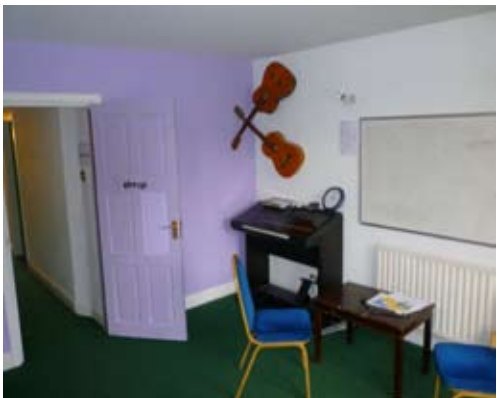
Medium Room 4.1 x 3.4 M